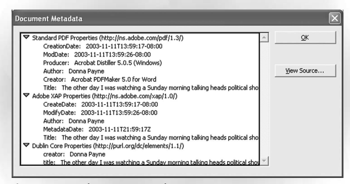
Figure 10. PDF document metadata.

Several resources are available to help you understand how to minimize or eliminate metadata from Microsoft Office applications. Third-party tools for removing metadata from Microsoft documents are available, such as Metadata Assistant from Payne Consulting Group (the company I work for). Other companies with products to combat metadata are Workshare,