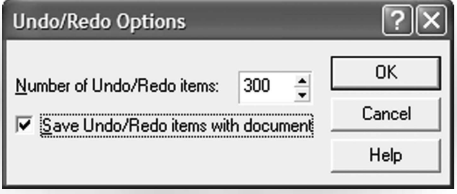
Figure 2. Undo/Redo Options.